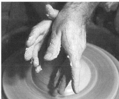
g. With continuing side pressure to prevent mushrooming, press clay back down.