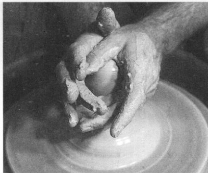
e. Raise the lump to a rounded peak.