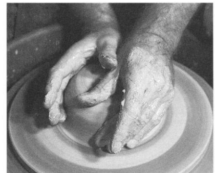
i. Finalize centered form after repeated wheel-wedging.