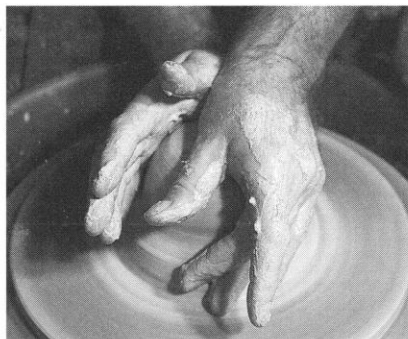
h. Continue pressing downwards as lump widens.