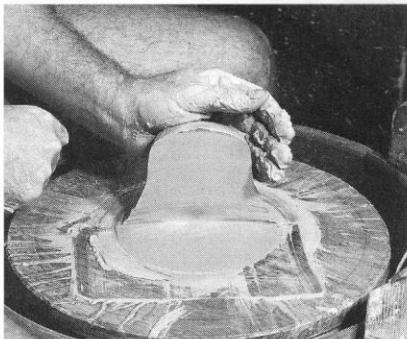
d. Cross section showing intermediate stage of wheel-wedging.