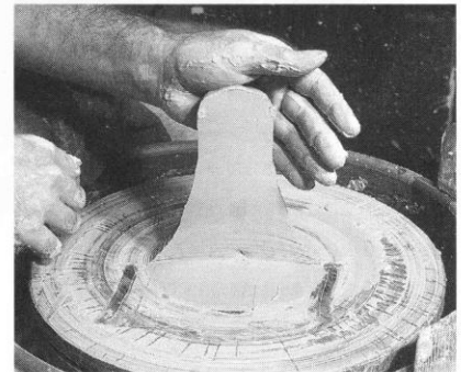
f. Cross section showing maximum rise, with heel of thumb poised to press clay back down.