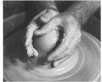
c. Continue the side pressure while hinging hands together, causing clay to rise.